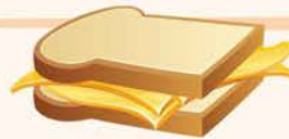
Gorilla Grilled Cheese Delight American cheese on Texas toast