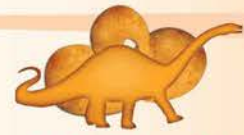
Shrimpkens™ Popcorn shrimp & Jurassic Chicken Tidbits™