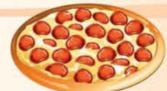
Castaway Kid's Pizza Cheese or Pepperoni