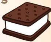
Tuki's Ice Cream Sandwich

Creamy chocolate pudding with crushed Oreo® cookies and gummy worms