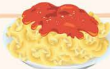
Python Pasta Served with your choice of Alfredo, Butter or Marinara sauce