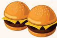
Rainforest Rascals™ Char-grilled mini burgers