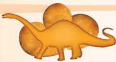
Jurassic Chicken Tidbits™ Dinosaur-shaped chicken nuggets Substitute Chicken fingers