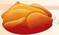
Cha! Cha!'s Chicken ¼ rotisserie chicken