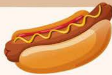
Hot Dog Traditional favorite